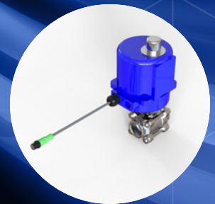
Actuated Ball Valve